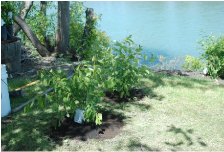
AT THE WATER'S EDGE: Buffers at the water's edge prevent erosion, reduce ice damage, intercept pollutants, and provide crucial habitat for wildlife.