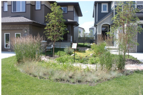
RAIN GARDEN: Small planted depressions that manage rain from downspouts and hard areas at home. Managing rainfall at home reduces stress on stormwater infrastructure and improves water quality in our lakes, rivers and streams. More diverse connected landscapes enhance habitat

Roofs and roads change the character of water, and our waterways pay. And you pay too — in the cost to treat water, in flooding and flood repair, in erosion, in pollution, in recreational opportunities, and in the health of the landscape overall.